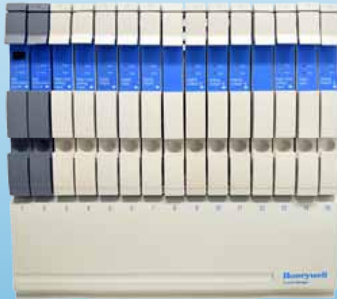
15 Slot HPM