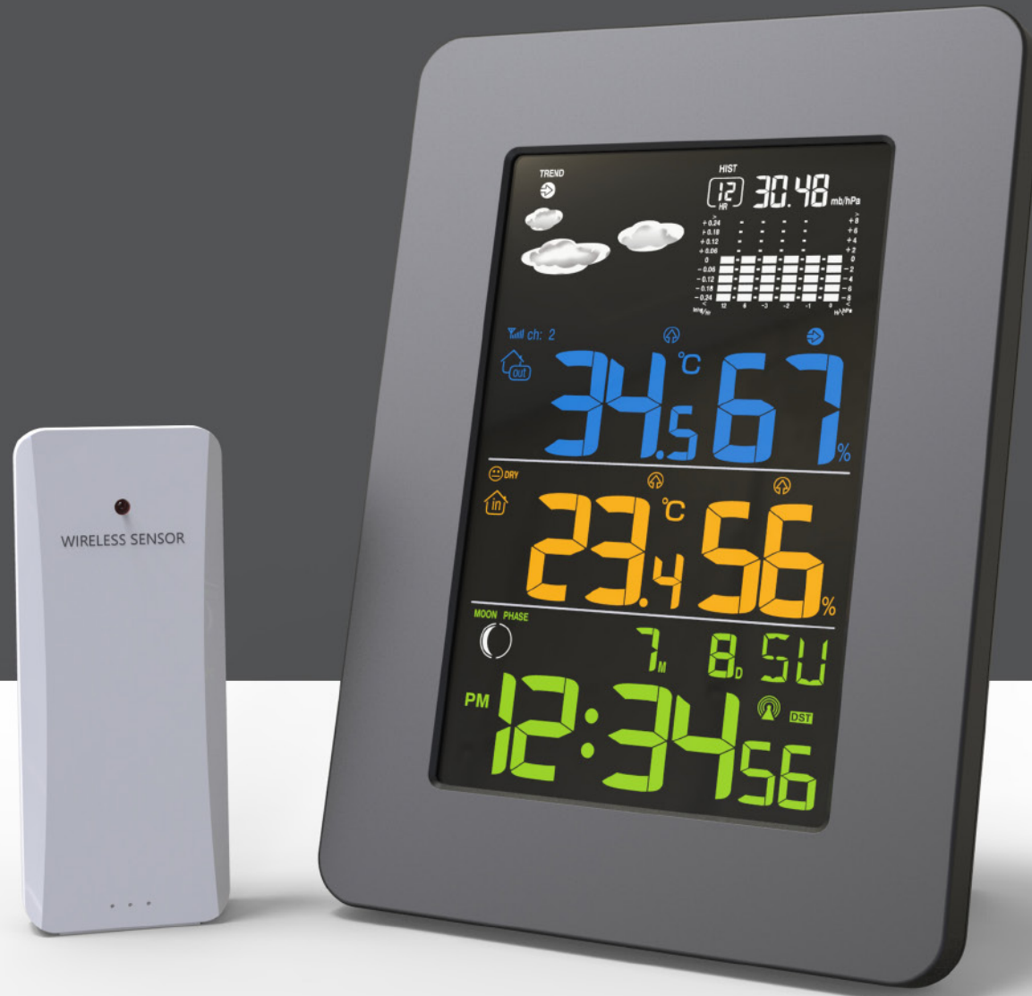
Weather Station with color display