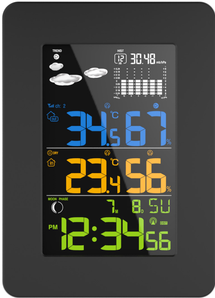
Weather station receiver