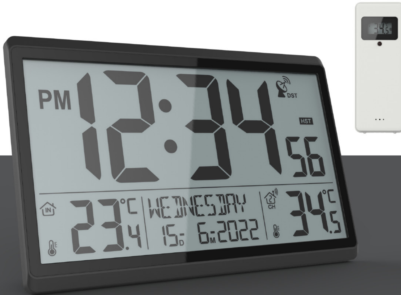
XXL Jumbo RC Wall Clock with In/Outdoor temperature