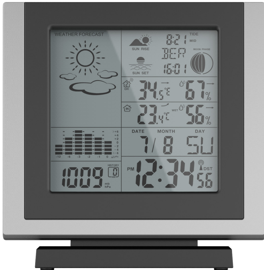
Weather station receiver