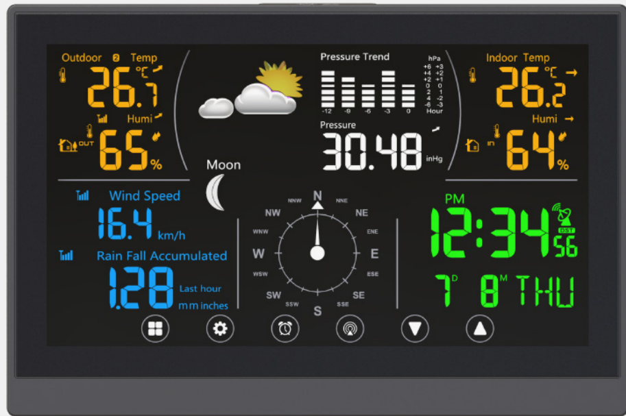
Weather station receiver