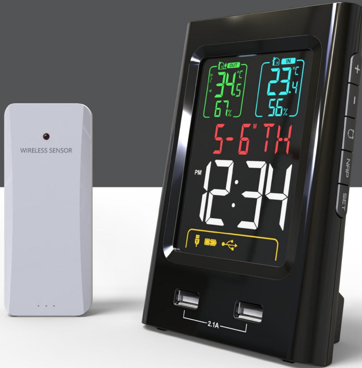
Dual USB Charging Clock with In/Outdoor Temperature & Humidity