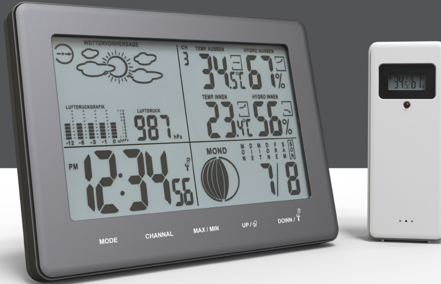
Weather Forecast Station with In/Outdoor Temperature & Humidity