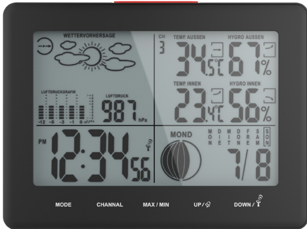
Weather station receiver