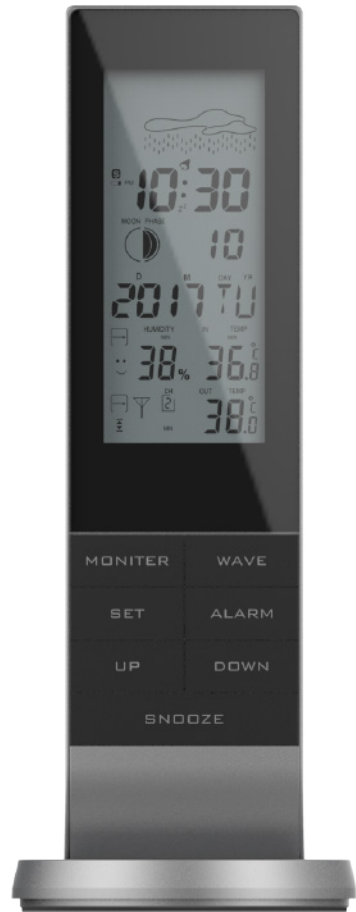
Weather station receiver