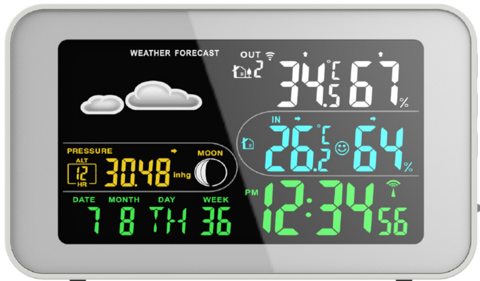
Weather station receiver